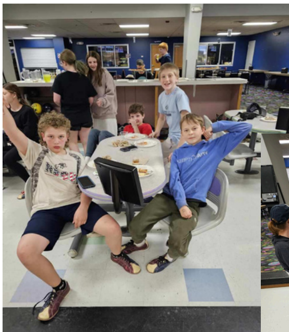
Charity youth in grades 6-12 enjoyed a fun night of bowling at Midway Lanes!