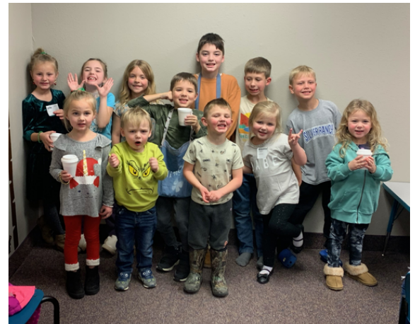
We celebrated with cake, hot cocoa, and FUN!