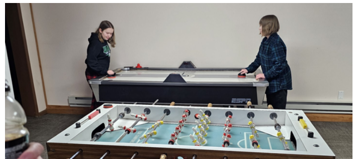
Everyone had a good time during the ski trip. They enjoyed indoor and outdoor activities, as well as time for food and fellowship.